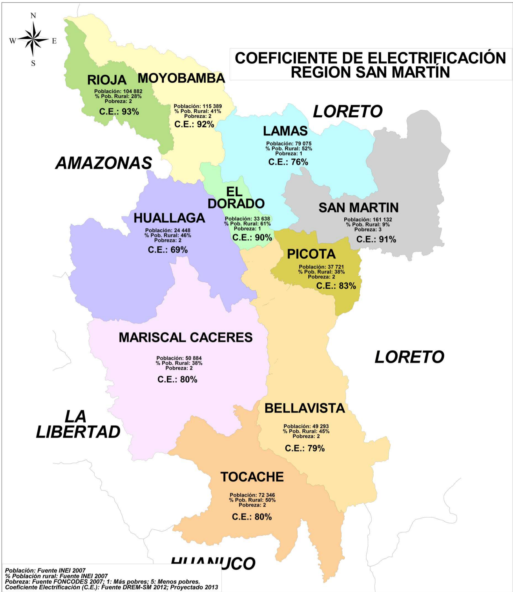
EVOLUCION DEL COEFICIENTE DE ELECTRIFICACION DE LA REGION SAN MARTIN